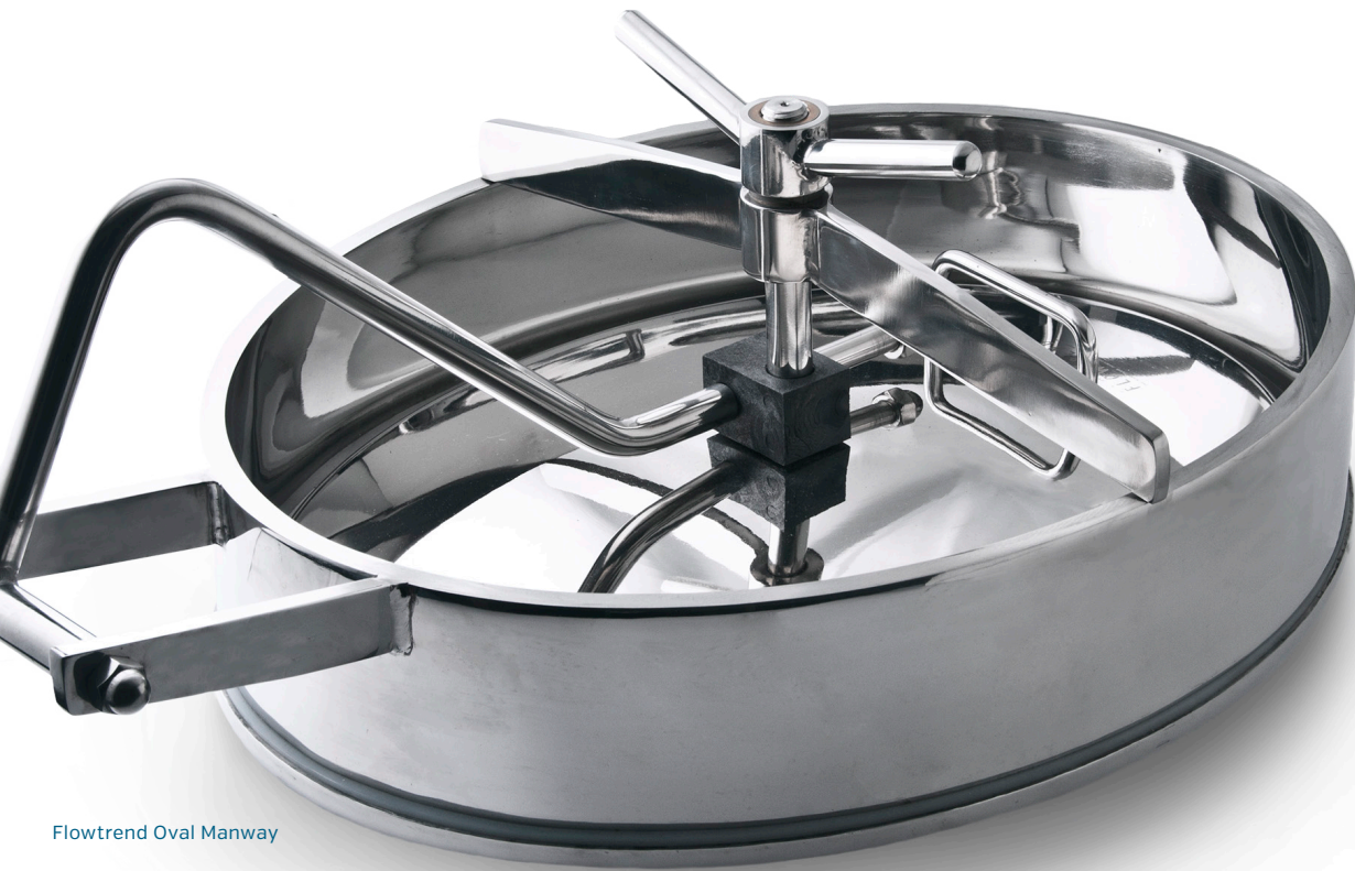
Flowtrend Oval Manway