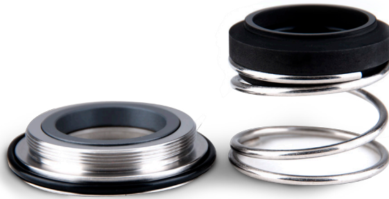
Replaces LKH 5-60 Pump Seal, Stationary & Rotary

With a wide variety of wear parts for all major OEM suppliers (utilizing their original part numbers), Flowtrend offers an impressive line-up of parts—all available, in stock and ready to ship the same day, reducing downtime and maintenance costs. Backed by an unconditional quality guarantee and at a fraction of name-brand prices, our products free you from dependence on the original manufacturer and its prices for replacements and repairs.