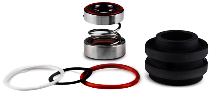
Replaces Fristam FPX 633 Pump Seal Kit

Carbon graphite impregnated with phenolic resin for added strength and durability ✓