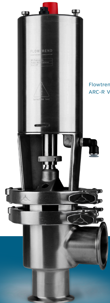
Flowtrend ARC-R Valve

Disclaimer: Flowtrend® is the manufacturer of these products. Flowtrend® is not affiliated with, sponsored by or endorsed by any of the manufacturers listed in this document. Flowtrend parts or products are not Alfa Laval parts or products, and Alfa Laval® does not endorse, approve or warrant Flowtrend's parts or products or their use.