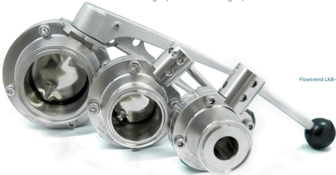
Flowtrend LKB-R Valves

Flowtrend's experienced staff of experts and technicians from the world's leading fluid handling providers will help you find the right product—at the right price.