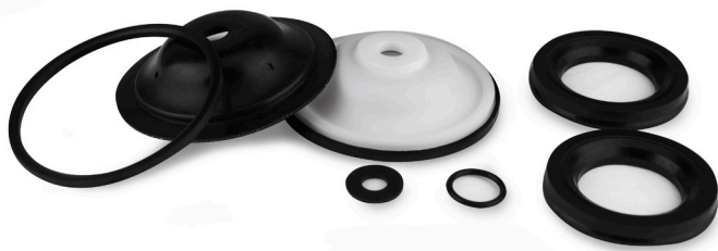
Replaces Alfa Laval ARC Service Kit

With a wide variety of wear parts for all major OEM suppliers (utilizing their original part numbers), Flowtrend offers an impressive line-up of parts—all available, in stock and ready to ship the same day, reducing downtime and maintenance costs. Backed by an unconditional quality guarantee and at a fraction of name-brand prices, our products free you from dependence on the original manufacturer and its prices for replacements and repairs.